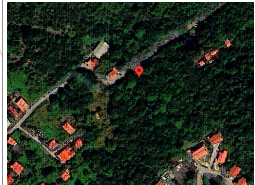
Saba, Troy Hill, Aerial view